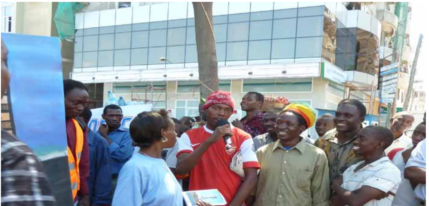
Open discussion on Public Space and pedestrianization took place with festival participants voicing their concerns and opinions on the topic