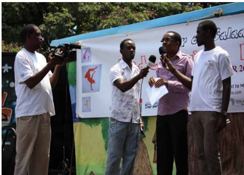
Media covering the Mayor of Illala's speech