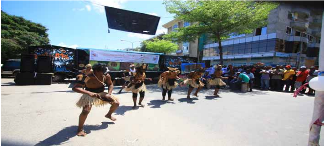
Traditional Dance Performance by AMKA productions