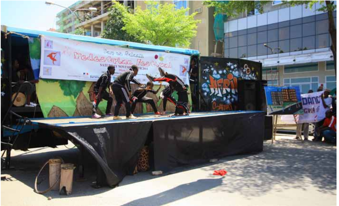
Performance by Kigamboni Acrobatics Group