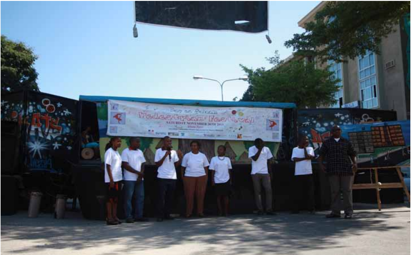
Festival Volunteers having their say on the pedestrian festival