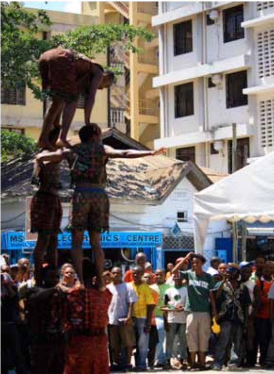
The Crowd is wowed by the Acrobatics group from Kigamboni