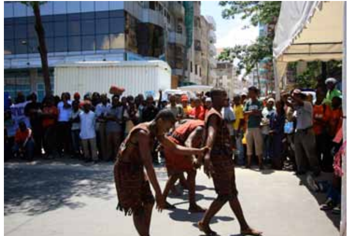
The Group takes a bow

Our two artist groups, the Shamba boys and the Sanaa I 6 group showcased their special artworks especially made for the pedestrian festival.