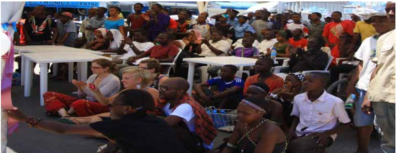
Audience Looks on