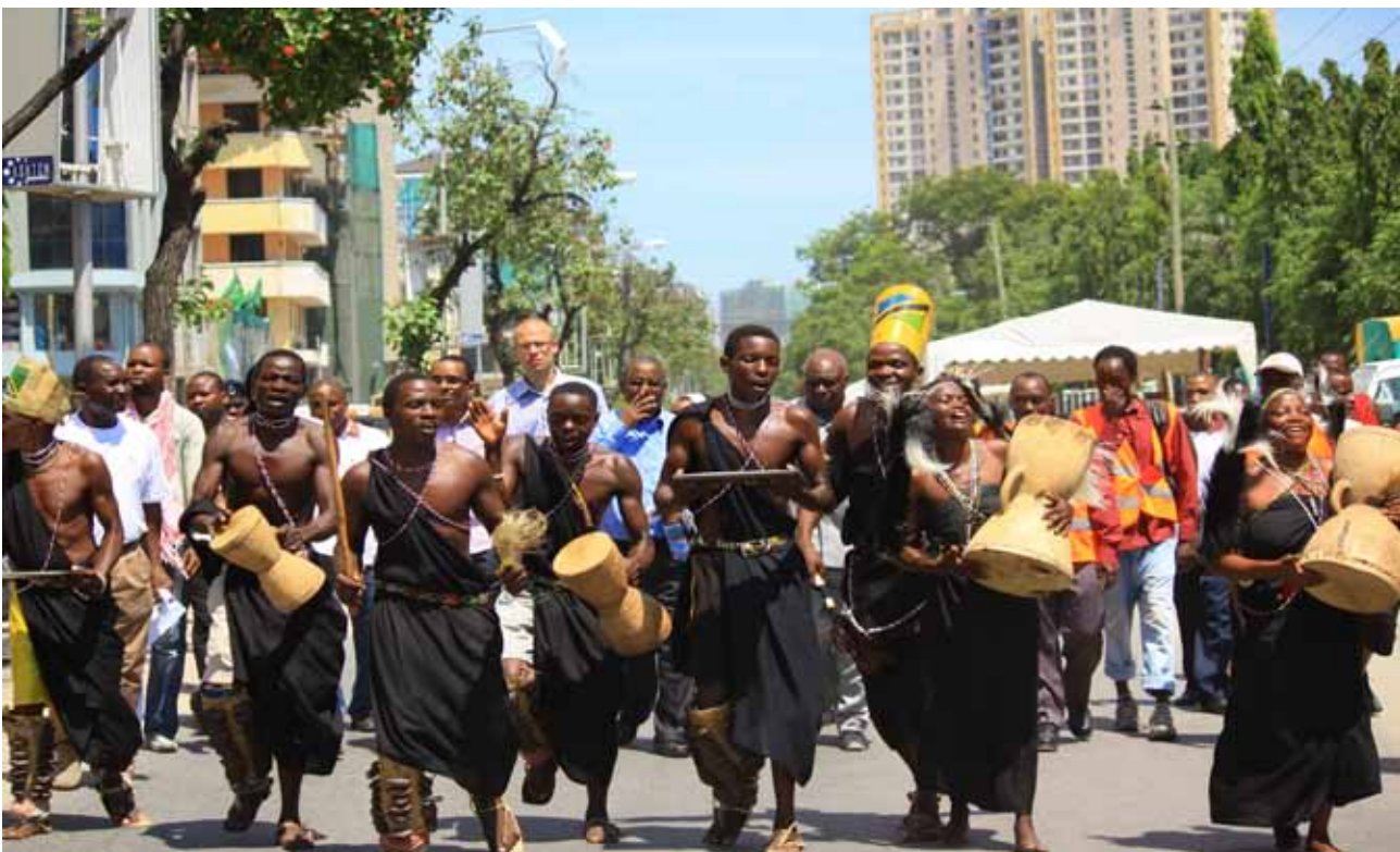
The Official "Opening Walk"