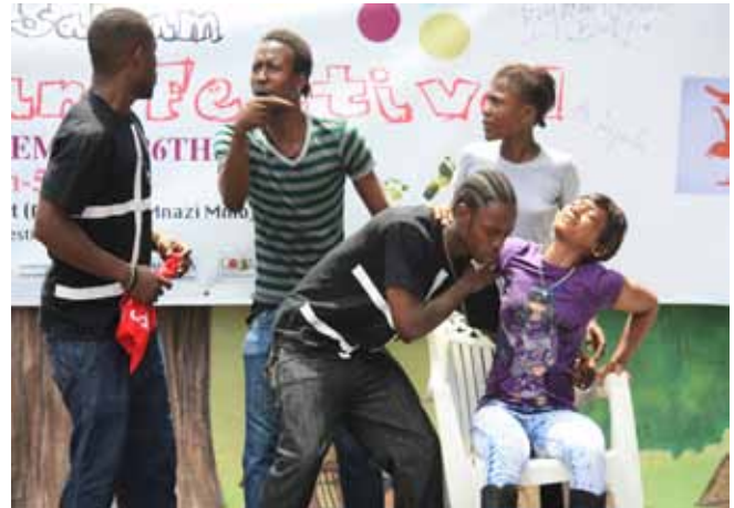
Performers from AfriKats of Tanzania House of Talent perform their play on pedestrianization