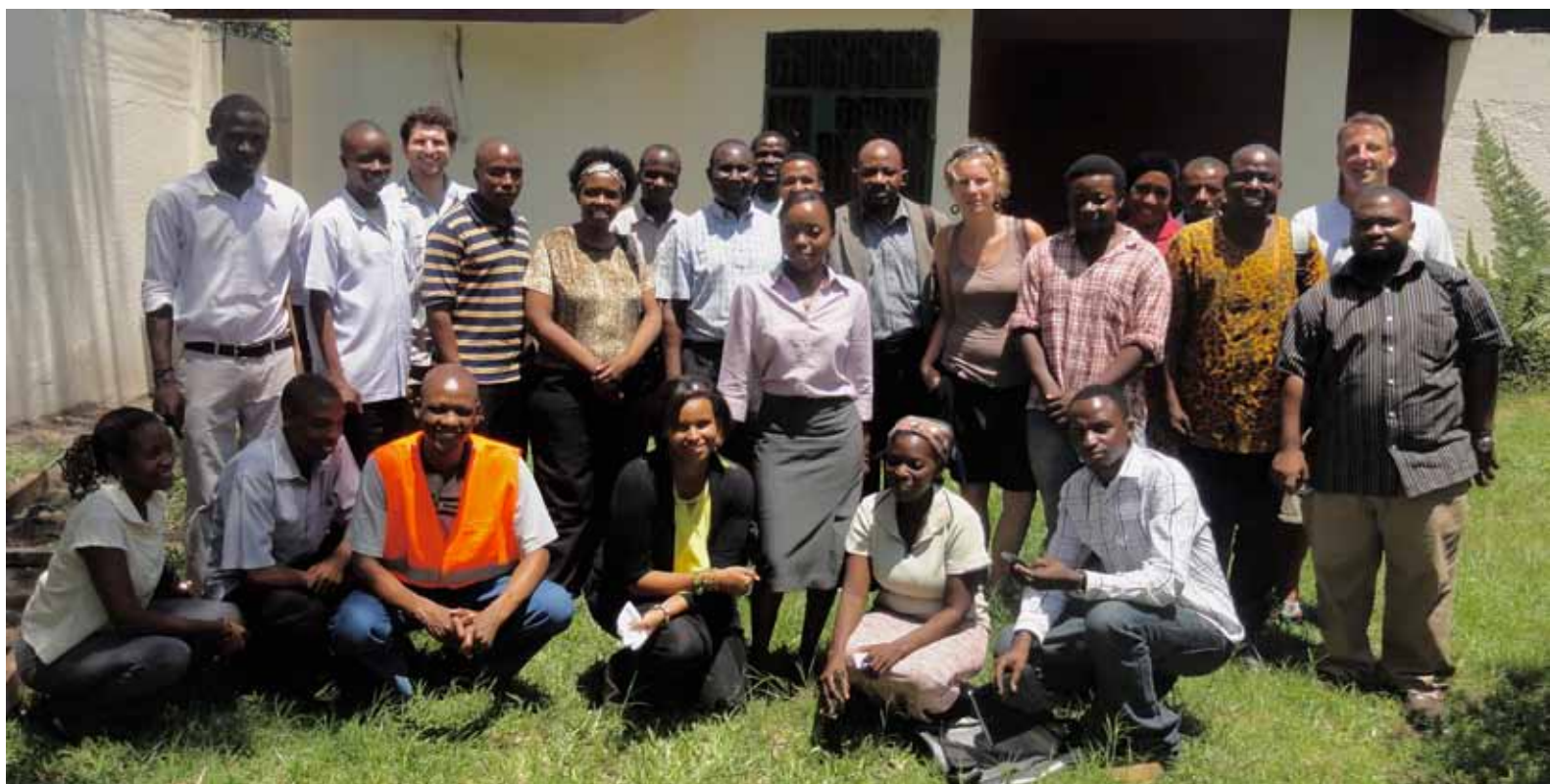
A group photo of the festival organizers and some of the participants of the 1st Dar es Salaam Pedestrian Festival