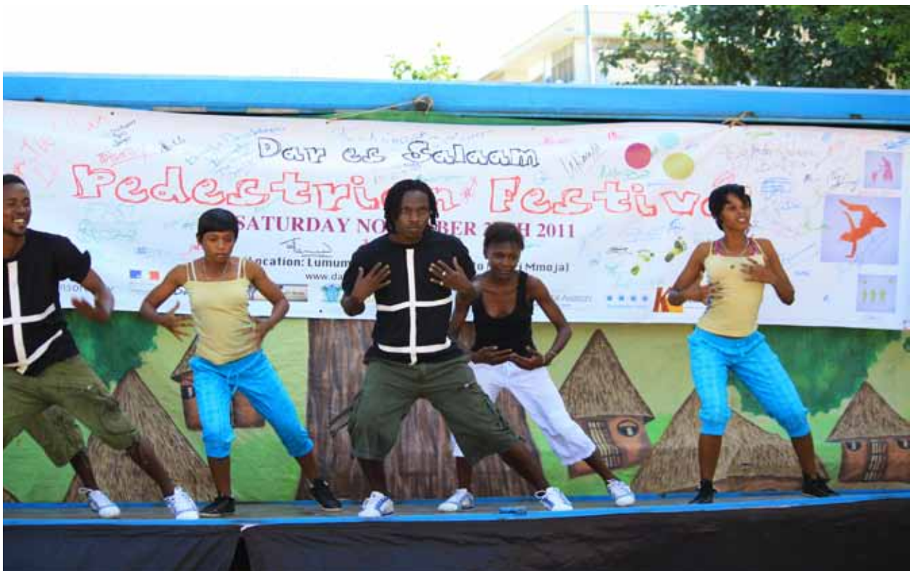
Afrikats Dance Performance