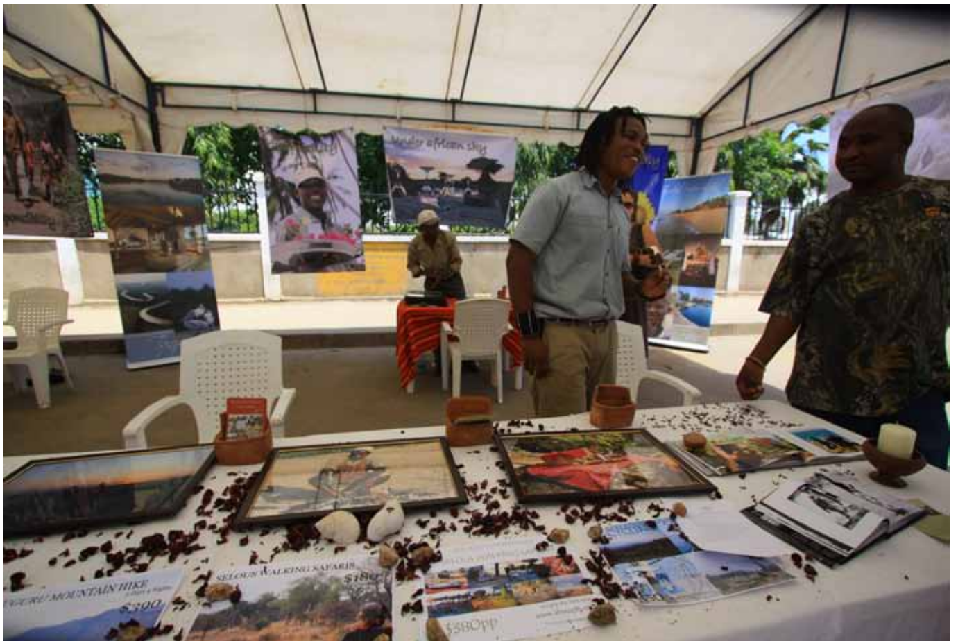
The Afri Roots Booth